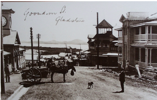
Goondoon Street 1910