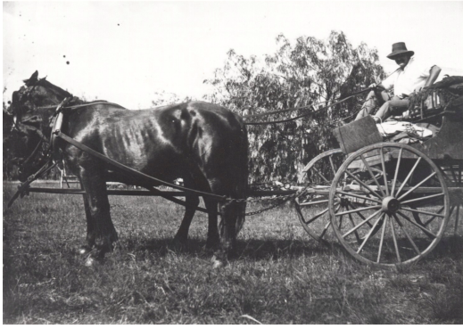
Travelling by horse and cart was a way of life

The hospital had a surgeon, a dispenser and a matron, The Officer in charge of Posts and Telegraphs had two assistants, a line repairer and a messenger.