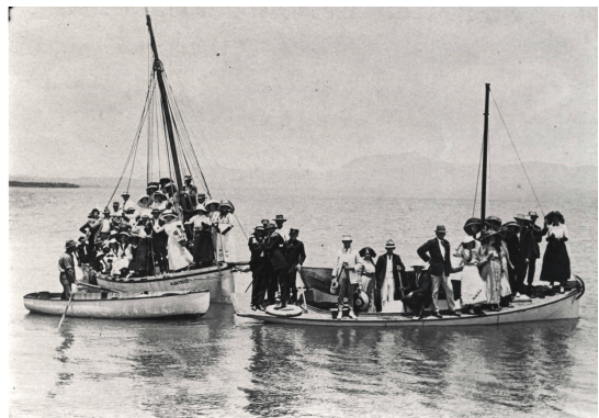
Local residents on yacht bound for South End, Curtis Island.

In 1914 the Harbour Board was formed to be restructured in 1926 to represent Gladstone, Calliope and Miriam Vale communities.