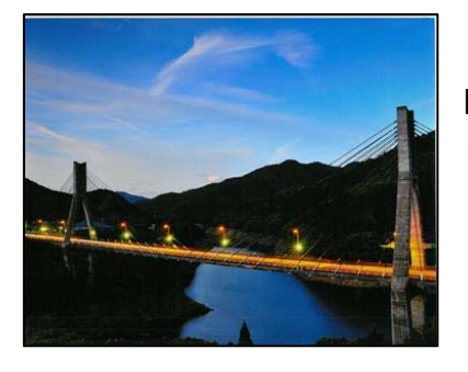
Manabu Ooga Utagenka-ohashi Bridge