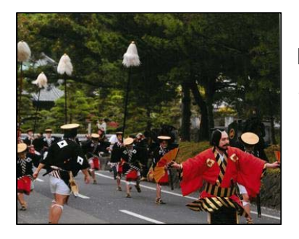
Manabu Ooga Daimyo's procession