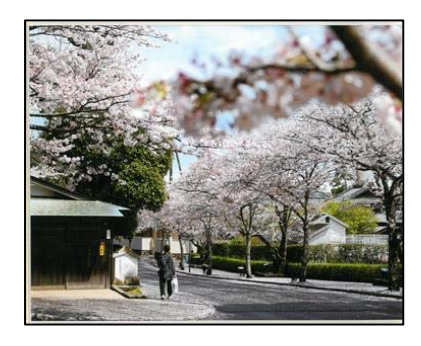
Tomoko Kato The way to happiness