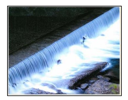
Tomoko Kato The bracing river air