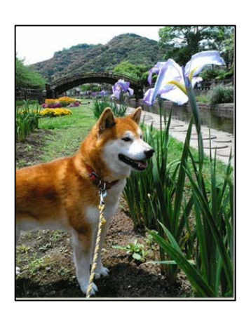
Tatsuji Inoue A Japanese iris and a pet dog