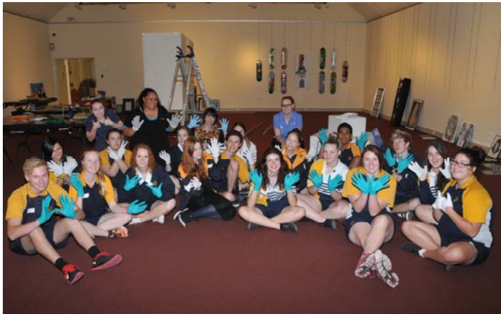
Teachers and students from Gladstone State High School at the 2014 Golding Showcase Exhibition install.

It is recognised that students from this region have to leave the area to undertake tertiary studies in Visual Arts and this places an additional burden on them and their families. It is intended that the Gladstone Regional Art Gallery & Museum Society Golding Bursary will benefit such students.