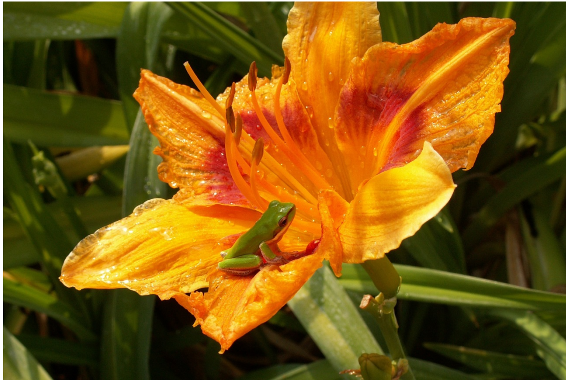
Bruce Hunt Green Frogs in the Rain (1)