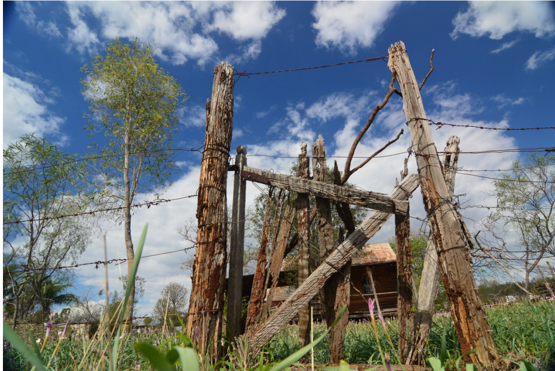
Kurt Warhurst Old Shack