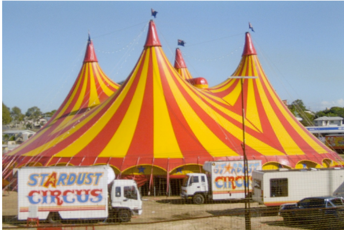
Ruth Crosson Circus comes to Town!