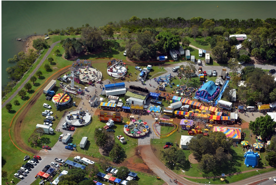
Brenda Strong And the Festival begins...