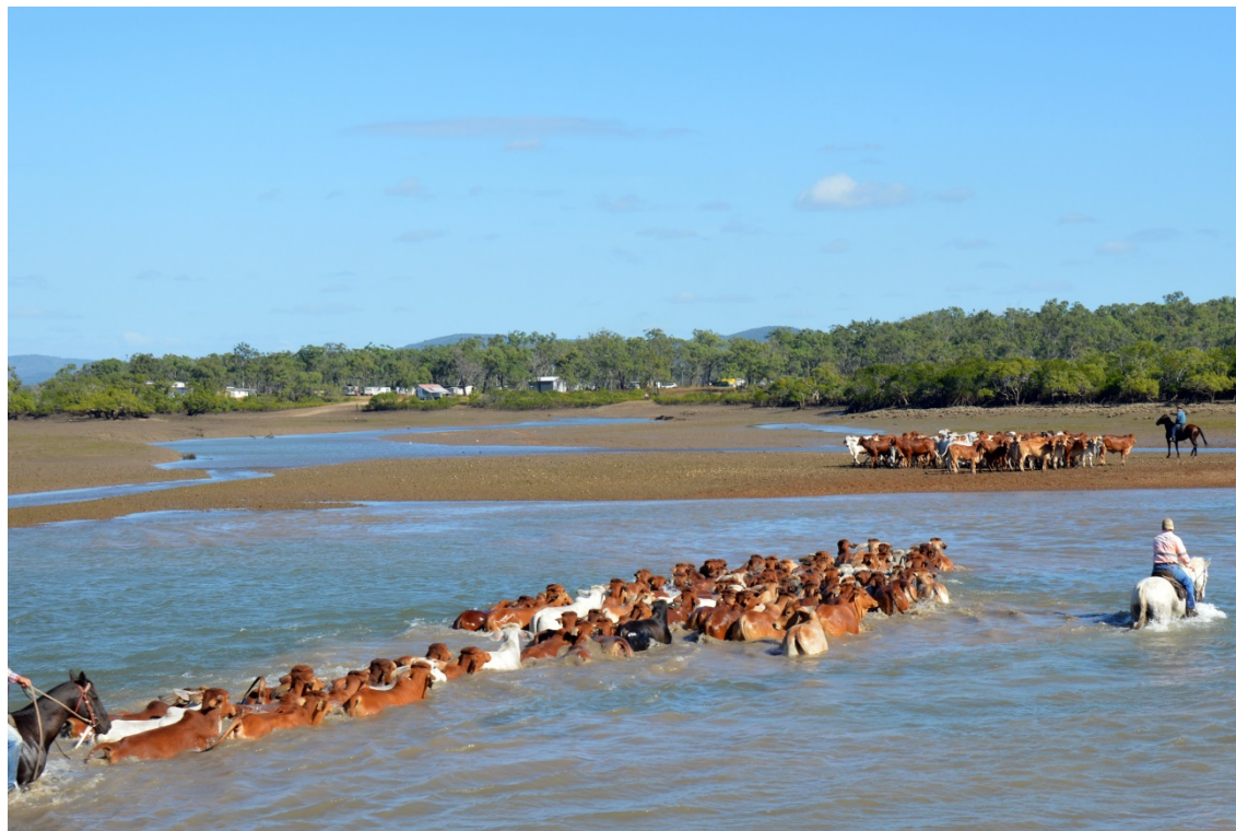
Amy Ahchay To the other side