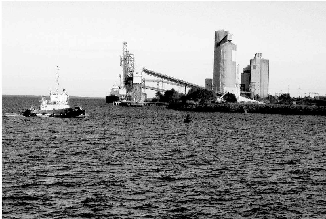
Hope Perchard, 11 years old The tugboat and the aluminium industry