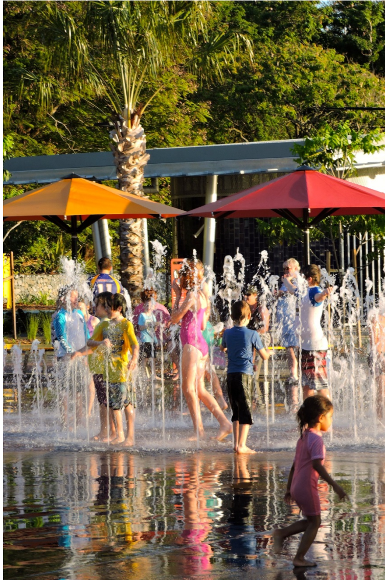
Trish Adlam Just add water