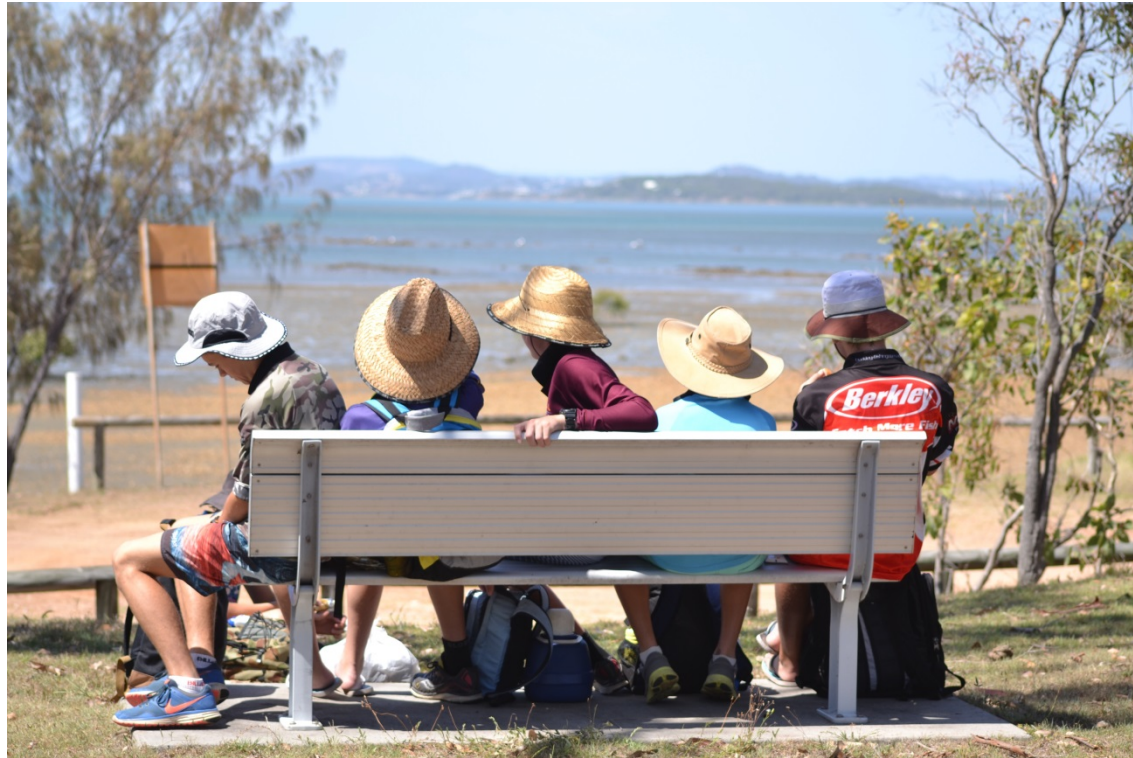
Nyomi Silver Tide High