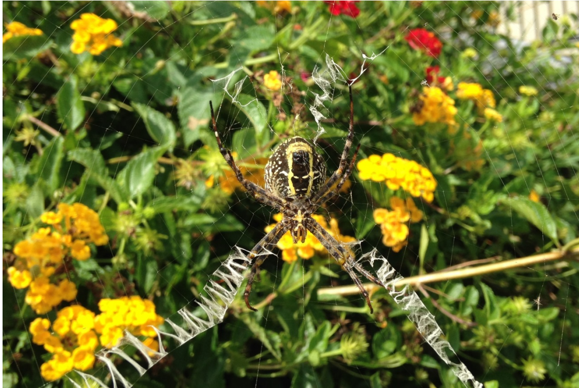
Barbara Conway Southern Cross Spider