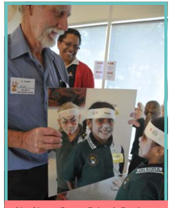
Kin Kora State School Students