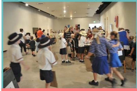
\label{eq:prep-Year7} \operatorname{Prep-Year7} \text{ students enjoying the activities}