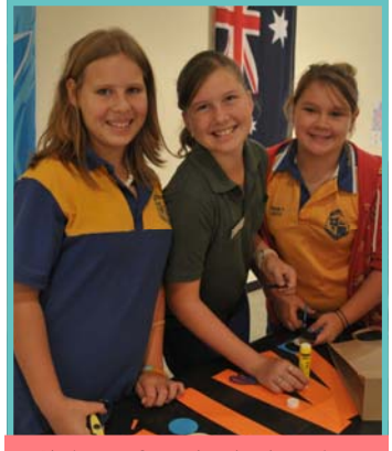
Gladstone Central School Students