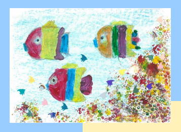
Issac Scriffignano Reef Fish (YSS)