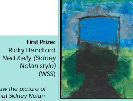
I saw the picture of what Sidney Nolan had painted and I

thought it was inspiring, so I painted my own.