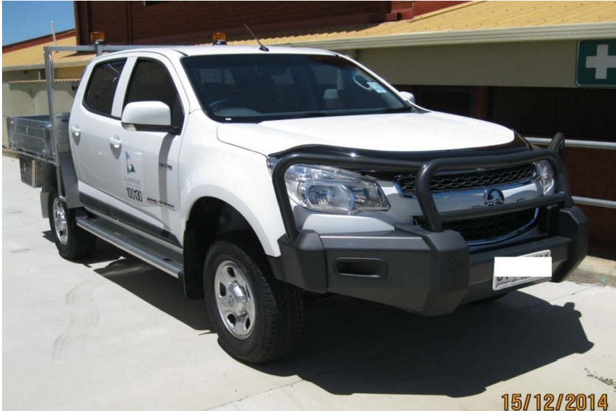
Vehicle 1 Average daily km: 134 Main location: Gladstone