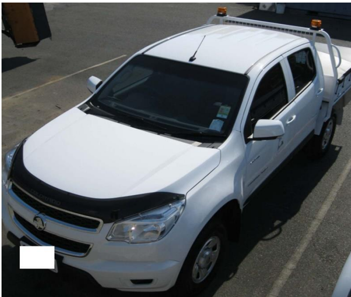
Vehicle 2 Average daily km: 102 Main location: Calliope & Western Gladstone Region