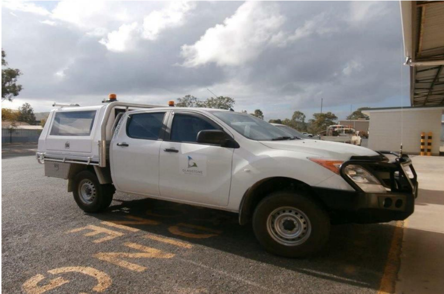
Vehicle 1 Average daily km: 90 Main location: Mount Larcom