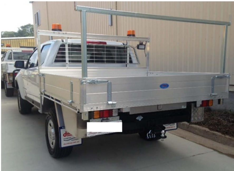
Vehicle 2 Average daily km: 35 Main location: Agnes Water & Miriam Vale