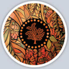
Above: Nuruy (Vine) , Wulan (Grass) (2017) Belynda (Bindi) Waugh