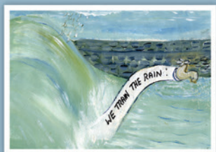
We Train the Rain (2017), Beryl Wood, acrylic on paper, digitised

“Although I attempt to portray some humour in my painting, this work acknowledges how reliant we all are on a supply of clean, fresh water for both domestic use and industry, and of course, reliant on the Gladstone Regional Council workers to keep training the rain.”