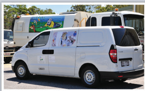
Gladstone Region Art on Fleet, pop up public art project

Supported by the Gladstone Region Regional Arts Development Fund (RADF) a Queensland Government and Gladstone Regional Council partnership to support local arts and culture in regional Queensland.