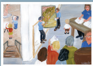
Our Gallery (2017), Beryl Wood, acrylic on paper, digitised (Image courtesy of the artist)

“Our gallery has many faces, my painting tries to show some of these – from exhibitions and workshops, to tutoring and encouraging all ages to be a part of Gladstone Region’s amazing arts community.”