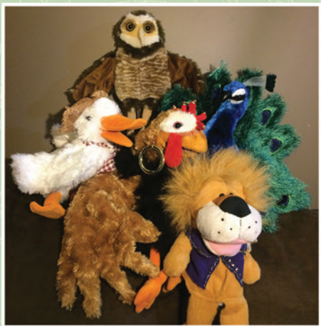
A selection of character-rich puppets from 'No Strings Attached', an interactive puppet-stand for children.

Take a comfy seat on a hay bale to watch the show as No Strings Attached raises awareness of everyone's responsibility to the environment. Take pART knowing we can make a better place for everyone.