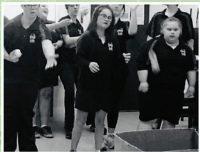
Rosella Park State School live theatre students.