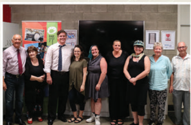
Left: Take pART presenters at the Gladstone Regional Art Gallery & Museum.

Manager & Curator, Gladstone Regional Art Gallery & Museum