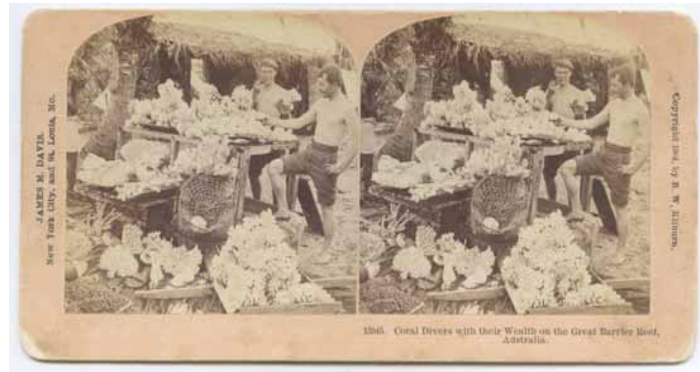
Great Barrier Reef stereoscope, 1904. Manufactured in New York for the burgeoning market in educational novelties.