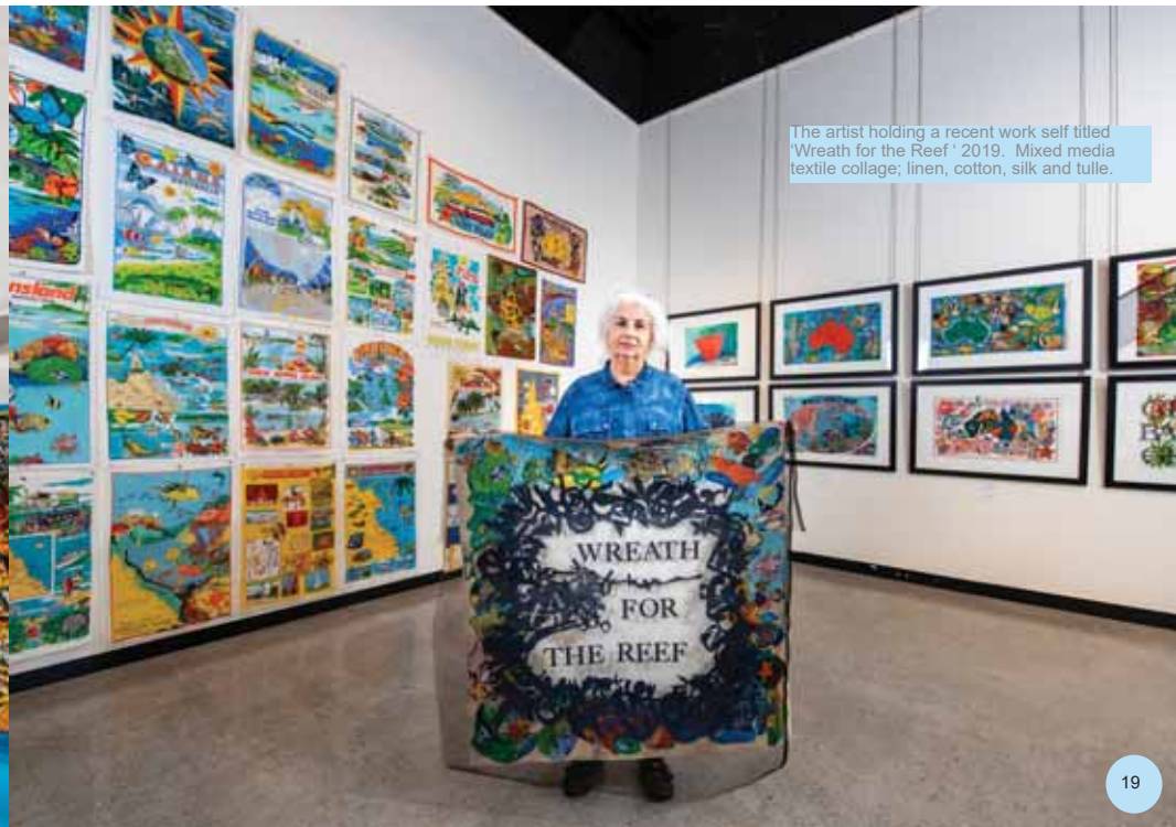
The artist holding a recent work self titled 'Wreath for the Reef' 2019. Mixed media textile collage; linen, cotton, silk and tulle.