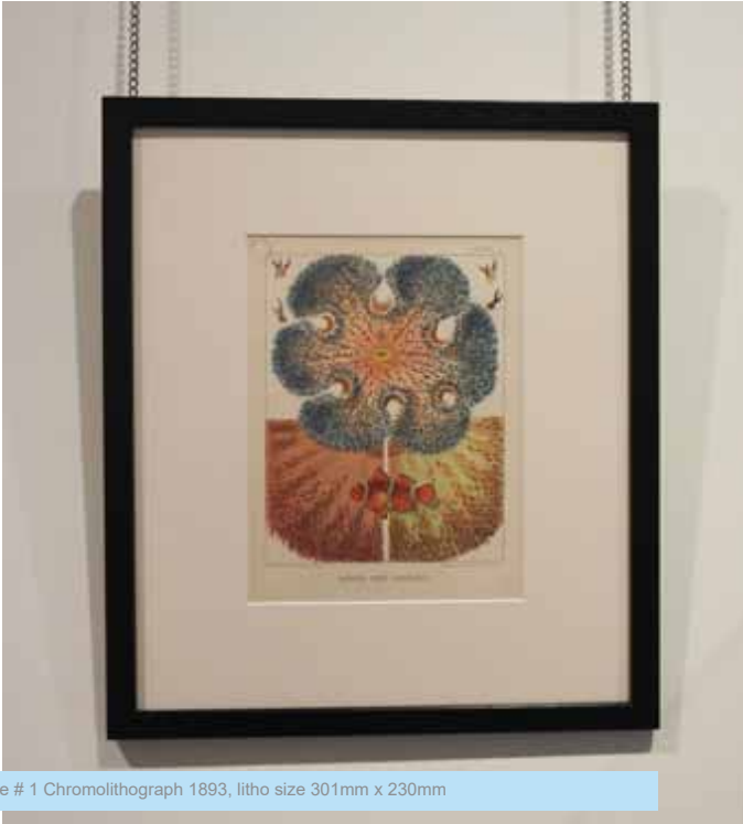
William Saville-Kent Great Barrier Reef Anemone # 1 Chromolithograph 1893, litho size 301mm x 230mm