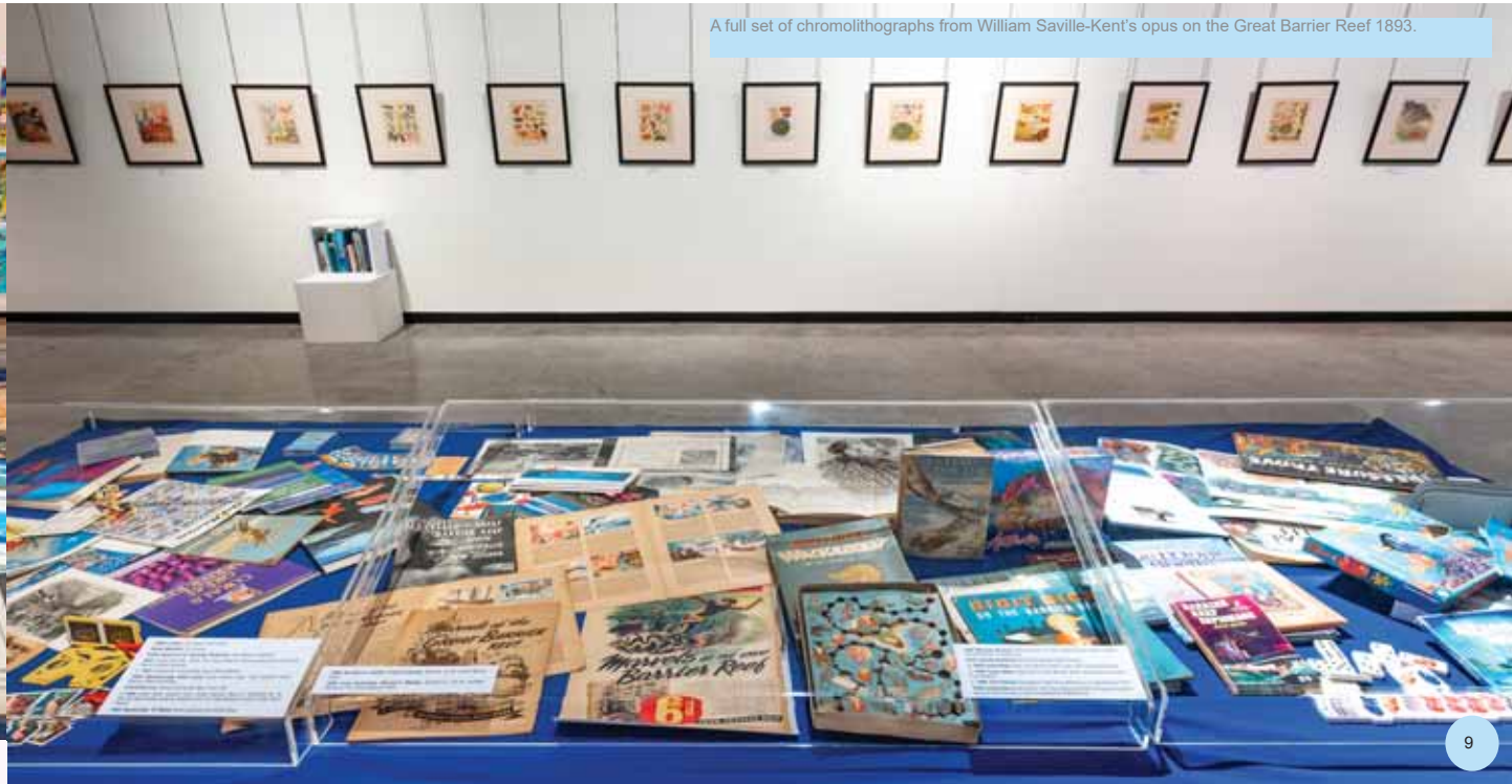
A full set of chromolithographs from William Saville-Kent's opus on the Great Barrier Reef 1893.