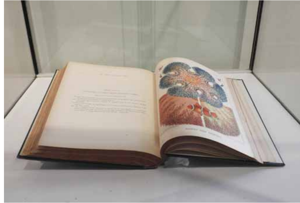
William Saville-Kent 'The Great Barrier Reef of Australia, It's Products and Potentialities'. 1893 London, cloth bound, 350mm x 270mm x 50mm 387pp