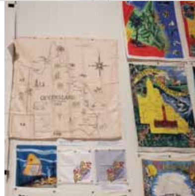
The tea towel set at left shows a Gladstone Billboard proclaiming the city as 'the Gateway to the Barrier Reef'. It dates from the 1970's.