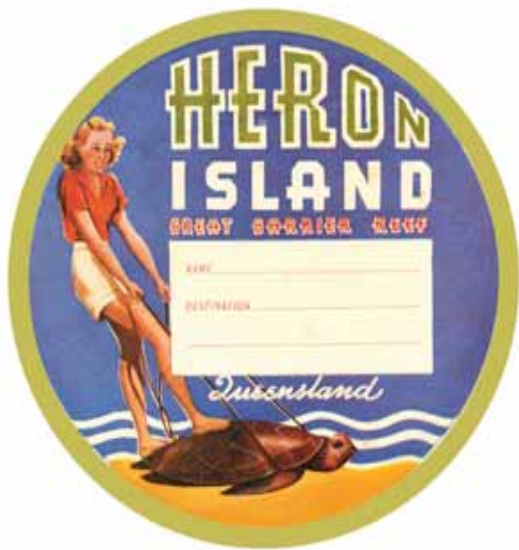
1940's tourist related ephemera; luggage label above and travel brochure.